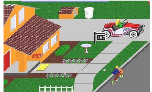
Biking in the digital age, as demonstrated by Atari's 1984 classic "Paperboy".

Before the end of 2010, the Commuter All Star program will make the transition from punch cards to an online system.