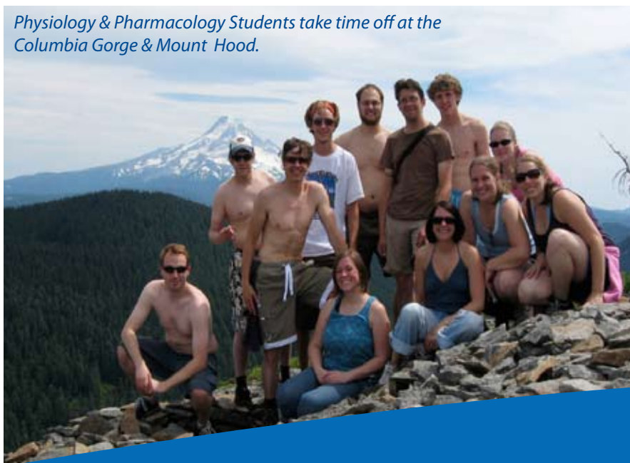
Physiology & Pharmacology Students take time off at the Columbia Gorge & Mount Hood.