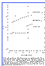
Figure 1. Power curves for two-sided t -tests at the 5% level of significance for the difference in mean 18-month decline in total functional capacity (TFC) between a treated and an untreated (placebo) group of Huntington's disease patients. The expected decline in the untreated group is 1.0 +/- 1.5 units/year (mean +/- standard deviation) based on natural history. Curves are drawn for detecting differences in mean decline of 0.57, 0.50, and 0.46 TFC units/year between the two groups. The planned total sample size for the trial is 296 patients (148 patients per group).