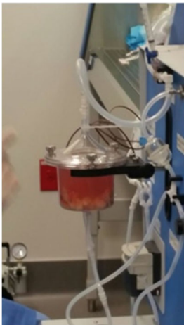
Isolating islets in the lab